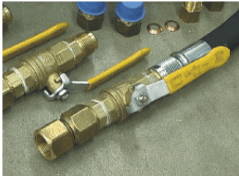
3/4" flare connections with isolation ball valves are supplied as a standard feature...